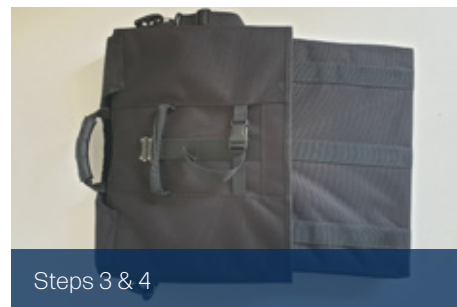
Steps 3 & 4