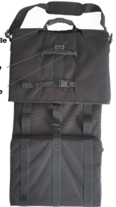
Discreet textile handle